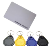
RFID Cards & Tags